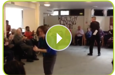
Watch a variety of short film clips from the Healthy Living Club