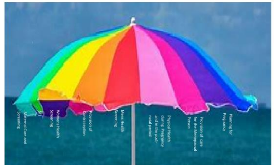
Sexual & Reproductive Health Community of Practice

One day a Community of Practice approach was proposed to develop a holistic broader view of SRH and improve patient care