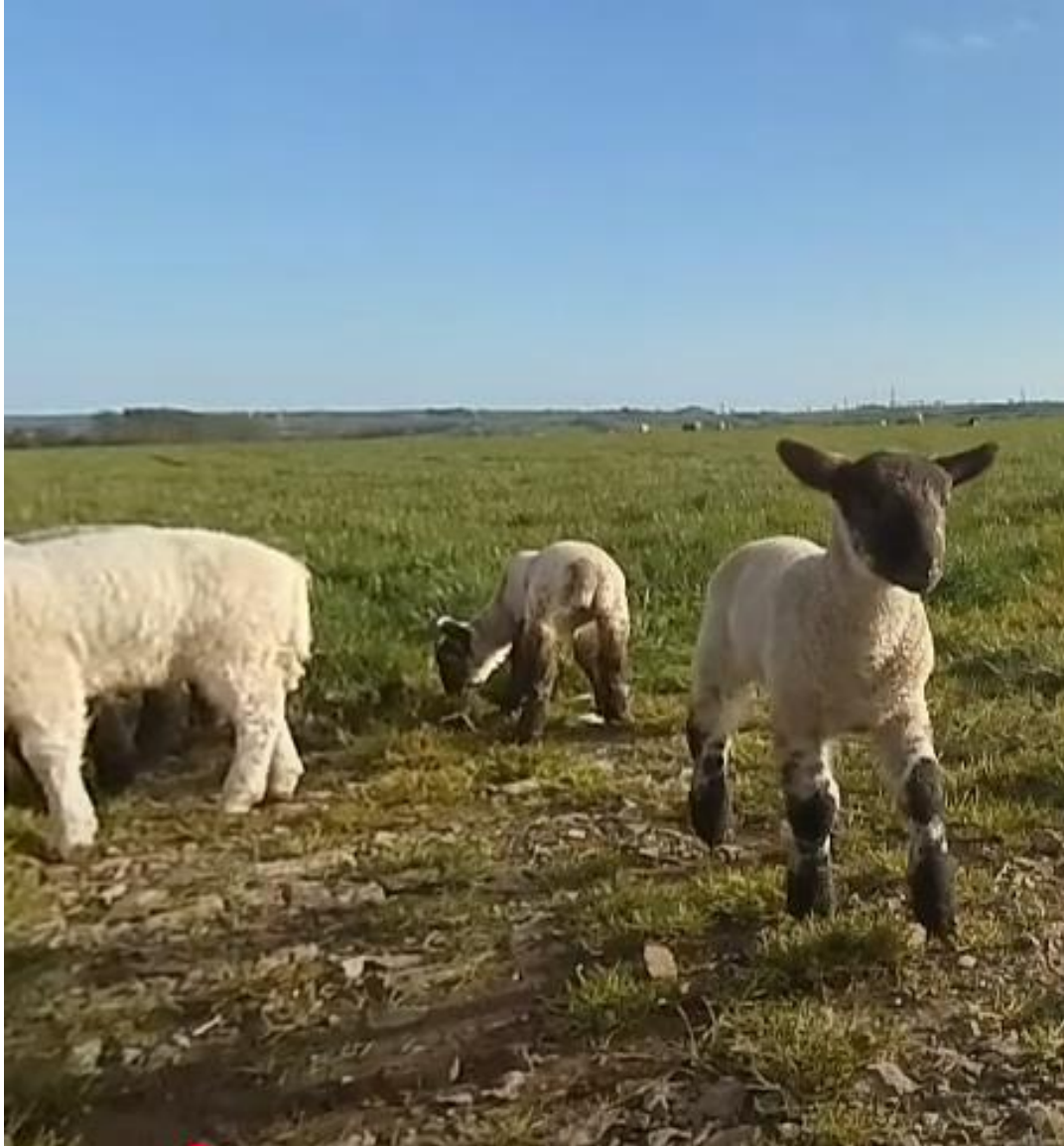
From Isolation to Inspiration