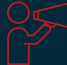
Marketing & Communications